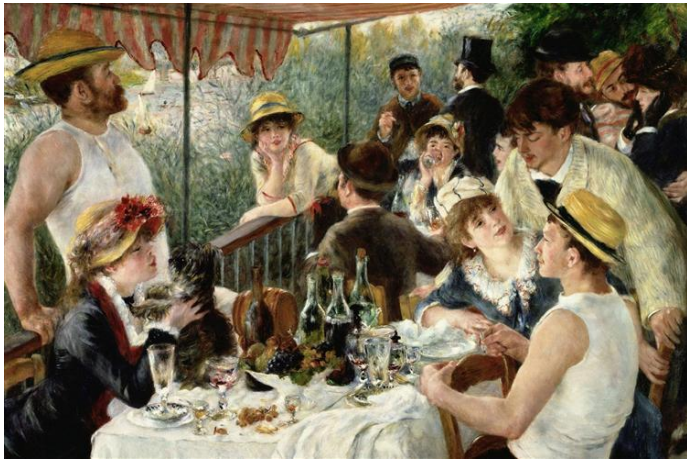
Title: Luncheon of the boating party

Before impressionism, artists tended to paint inside. As impressionists were often outside they looked at how the sunlight changed the scenes. They painted quickly and used bold (and quite messy) brushstrokes.