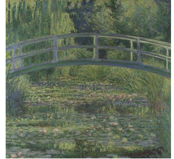
Title: The Waterlily Pond