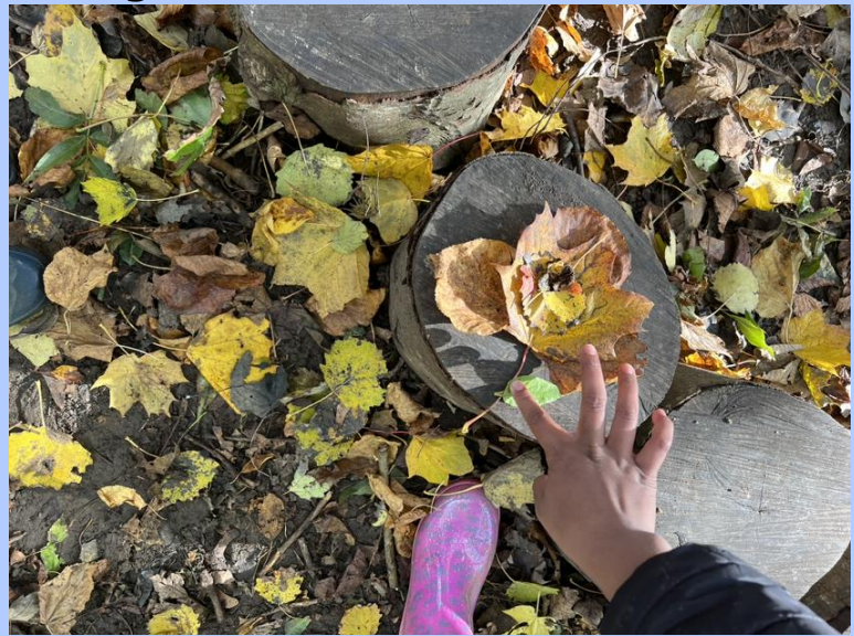
Remembrance Day Poppies

Falcons Class have been combining outdoor learning with other areas of the curriculum. In their sessions with Mrs Evans, the children have been working on activities which include mathematical problem solving and Remembrance themed artwork.