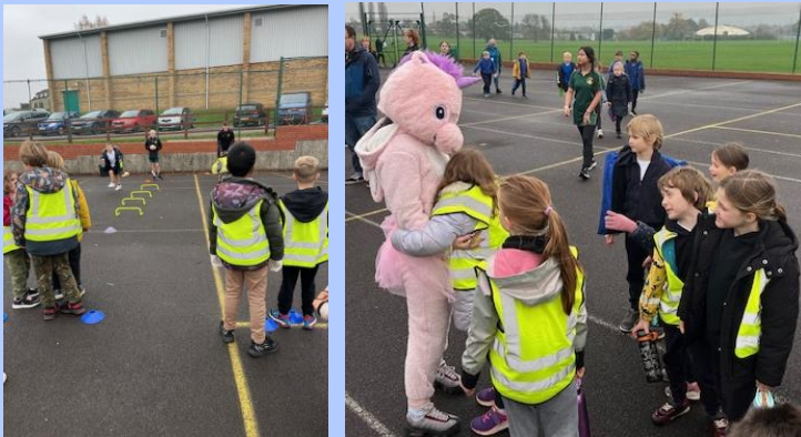
Puffins Multi Skills Event at Hardenhuish

2 nd – Falcons and Kingfishers trip to Science Museum, London Tues 3 rd & Weds 4 th – Christmas performances – Wrens, Owls, Starlings and Robins 9.30am and 1.30pm Fri 6 th - Non-uniform day for Christmas Fayre donations Sat 7 th – Christmas Fayre 11am-1pm w/c 9 th – Christmas Lunches week Tues 10 th – FORS Christmas Present Room Mon 16 th – Christmas Parties – Puffins, Nightingales, Hawks, Buzzards, Falcons and Kingfishers Tues 17 th – Preloved uniform sale in hall at 2.40pm Weds 18 th – Christmas Parties – Wrens, Owls, Starlings and Robins Fri 20 th – Christmas Jumper Day and last day of term