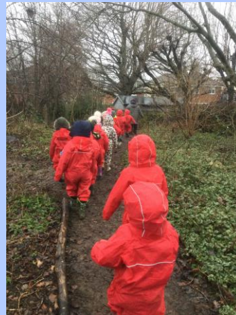
Wrens Class – Outdoor Learning