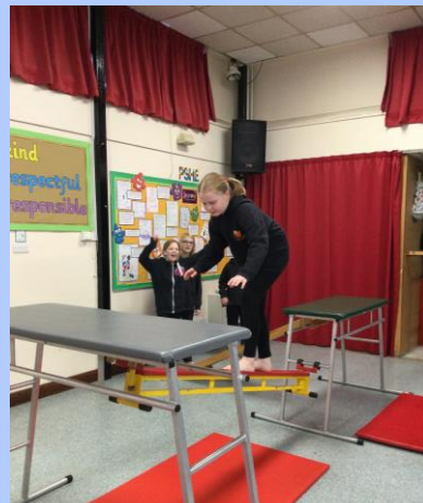
Kingfishers Class – Apparatus in PE